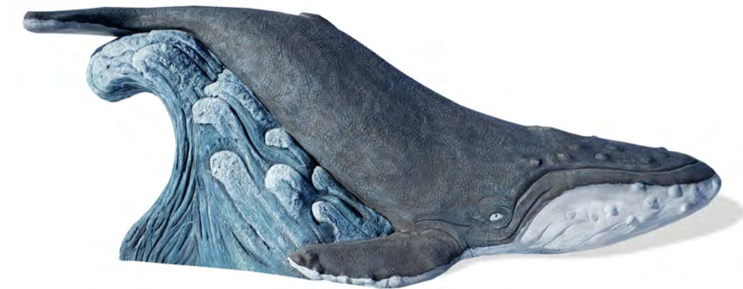
3 Whale Access_TC026